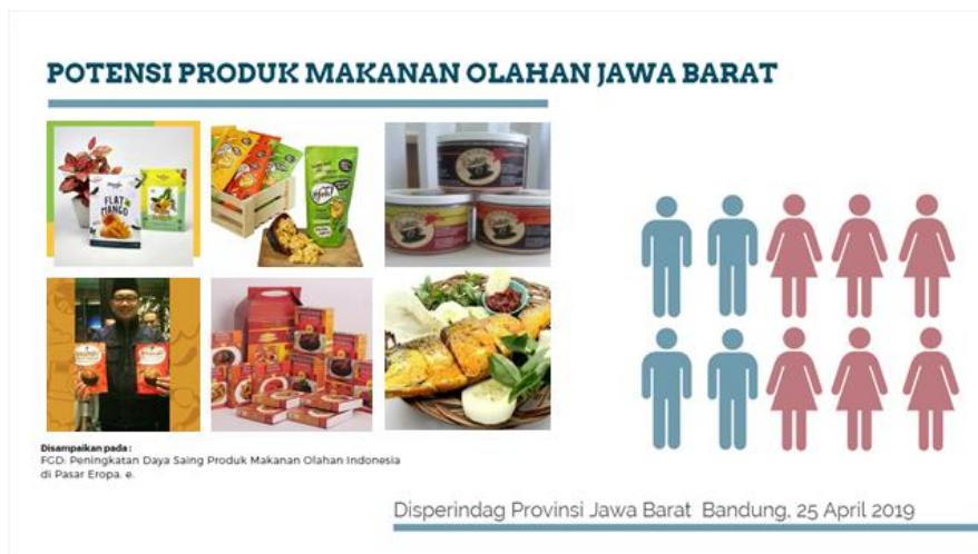
Figure 1. Potential of Food Processed Products in West Java, Indonesia

Sea catfish has denser flesh, different taste than other fish. So that with the dense meat, various processing can be carried out, namely coconut milk, pindang gombrang, and salted fish. From the characteristics, processing methods and various benefits of sea catfish, many regional entrepreneurs in Pangandaran Regency take advantage of this moment, especially processing it into salted fish, jambal roti. So many people produce this salted jambal roti fish, so there is over production. This is because the marketing for this product is still limited and there are still many who have difficulty accessing this product in several regions and even some countries.